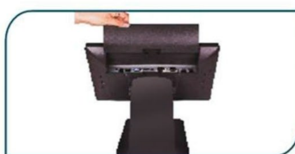
Easy to plug cables